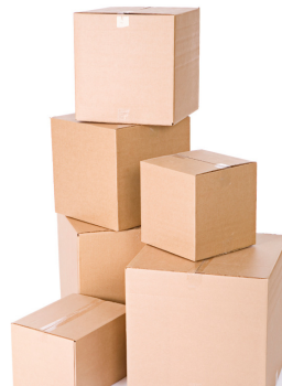
We kit your parts Ship when you're ready